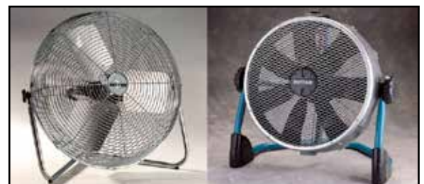
Previous generation Holmes High-Velocity Floor Fan (left) compared to quieter and more efficient new design (right).

Review design performance, analysis, and test data with performance maps that are flexibly plotted and updated automatically with each geometric change.