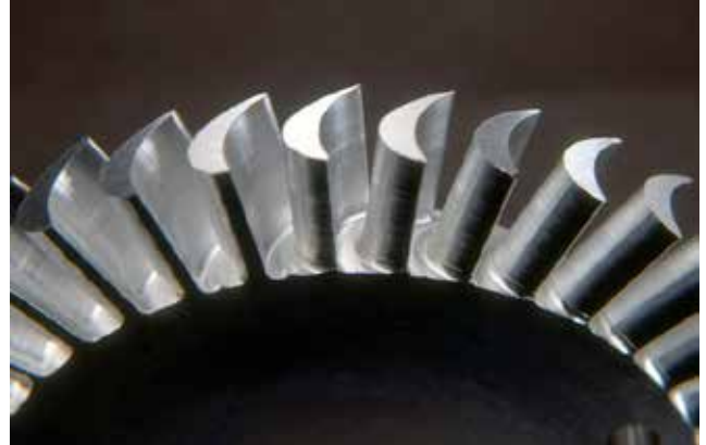
Axial blade row designed with AXIAL.

AXIAL utilizes integrated performance map plotting. Users can view blade angles and velocity triangles at the rotor inlet and exit, as well as view results in a flexible spreadsheet-like table view. Tables are customizable through separate filters, with the user able to create any number of filters, select what to display, and customize the labels as well.